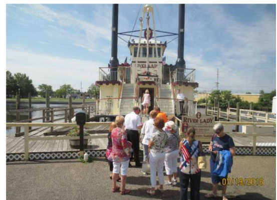
Wiley Mission Residents on a Nature Tour

Another photo in that story shows Wiley residents on a Nature Tour by Boat.