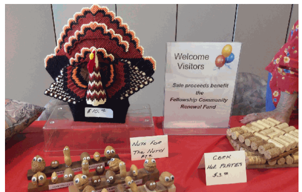
Fellowship Village Activity Fair

Arts and Crafts Imagination can flourish in later life and enable a person to take pride in showcasing his/her talents. Even artistic novices can be creative.