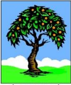
The Tree Unites the Branches; The Branches Bear the Fruit