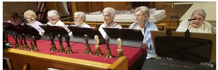
House of the Good Shepherd Bell Ringers