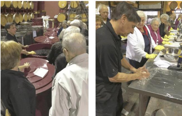
Applewood Residents at the Grape Escape

Field Trips for Seniors has photos of an Applewood trip to the “Grape Escape” that involved making fresh mozzarella.