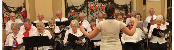
Fellowship Village Chorus

Music, Music, Music "Music is the social bonding that brings us together and keeps us together. Music has the power to stir up old memories with the first few notes. Music encourages exercise and discourages isolation."